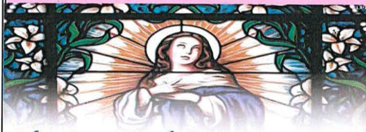
The Immaculate Conception OF THE BLESSED VIRGIN MARY -DECEMBER 8-

"Immaculate Mary, your praises we sing!" December 8th is one of our special feasts celebrating Mary - the Solemnity of the Immaculate Conception. From the beginnings of the Church, spiritual writers and theologians have acknowledged the innocence and holiness of Mary. St. Irenaeus called her the "new Eve." Both of them faced - with pure freedom - to accept or reject God's invitation to cooperate with His plan. Mary said "YES" and thus began the work of redemption bringing Christ into the world! The Church began to celebrate the feast of Mary's conception in the early Middle Ages. In 1854, Pope Pius IX infallibly declared that Mary was free of original sin from the first moment of her conception. On this feast day, we celebrate the beauty and goodness of Our Lady and remind ourselves to strive to follow her example of faithful discipleship.