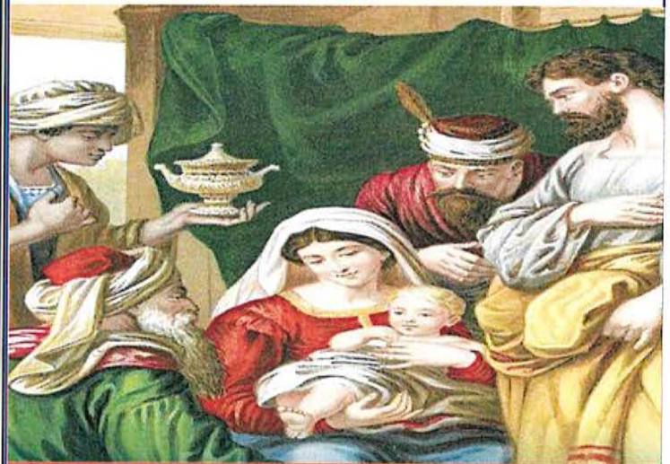
THE EPIPHANY OF THE

The "Wall of Love"... at our neighbor, Wilson Elementary School, is always in need of additional donations to assist families in need. Items such as toiletries, food & snacks, plastic baggies, socks, hats, gloves, scarves - ANYTHING USEFUL - can be dropped off in the blue container in the church vestibule. We'll see that items get taken to the school.